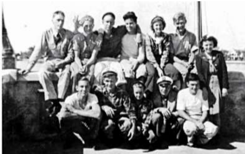
Sarasota Sailing Squadron's Founders

The Sarasota Sailing Squadron is a non-profit club organized to encourage the sport of sailing, to promote the science of seamanship and navigation, to sponsor cruises, races, and instruction classes for adults and children, and to foster a spirit of good fellowship, courtesy and sportsmanship; and to provide social venues for members and their guests and serve as a community asset to the City of Sarasota and the surrounding area.